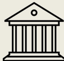
Member's CU Account