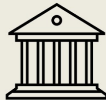
Member's CU Account